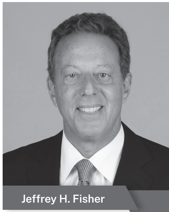
Chairman, Chief Executive Officer and President

I hope this letter finds each of our shareholders, interested parties and employees well. We accomplished much during 2025. Operationally, we produced solid results despite very volatile conditions, and our intense asset management enabled us to hold margins essentially flat year over year. Strategically, we sold four of our older hotels at a very attractive cap rate, using a portion of the proceeds to lower debt and to acquire shares under our newly implemented share repurchase plan.